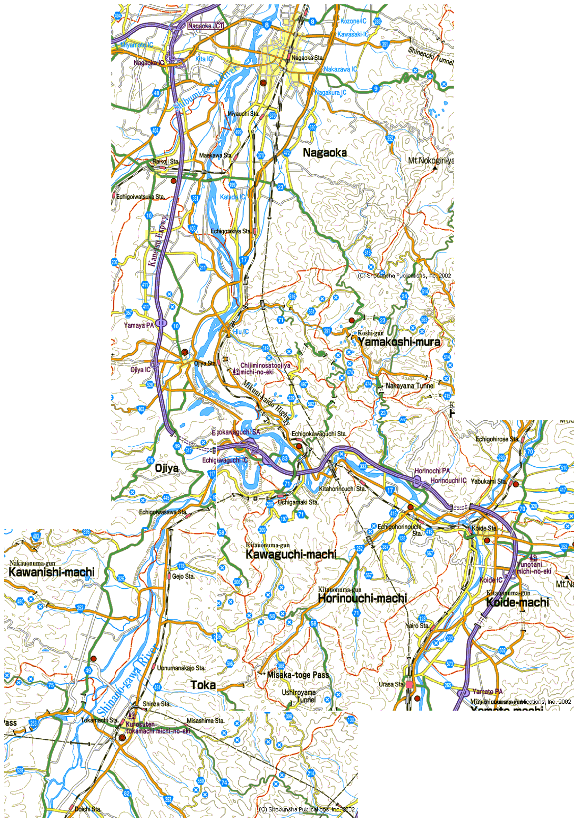
Figure 2.2 Location of cities and villages in the epicentral area (maps from JNTO)